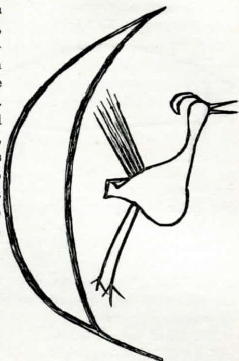
FIGS. 12 and 13.

No. 13, perhaps designed to represent a canoe, twenty-eight inches across from the extreme point to the other, and five and a half inches from the top to the bottom at the largest point.